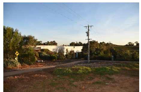
Photo right: The Maltby Bypass complex of bridges provides a litter strewn, unsightly, unsafe and difficult access into Werribee River Park, a large open space but with no easily found access road, car park or toilets.

Our Forests: The Werribee River is a major waterway in the urban growth expansion area to the west of Melbourne. The headwaters of the rivers must be protected by declaration of the recent Victorian Environmental Assessment Council 'Central West Investigation' recommendations. Parks Victoria should be permanently and securely funded to become the well-resourced guardians of those headwaters.